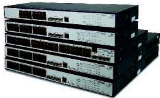
from top to bottom: 3Com Baseline Plus, Switch 2920, Switch 2928, Switch 2952, Switch 2928 PWR, Switch 2928 HPWR

Baseline Plus Switch 2900 models are available with 20, 28, and 52 ports; two 28 port PoE models (one with 170W budget and the other with 365W power budget)