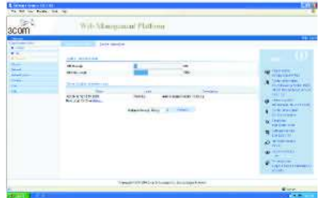
PoE summary information for the Switch 2928 HPWR.