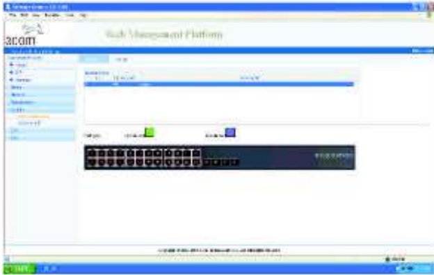
Device summary information for the Switch 2928 HPWR.

With the switch web management interface, even novice users can quickly and confidently configure the switch during initial setup and manage it during normal operation. Graphical switch and port views provide a clear understanding of switch status and configuration.